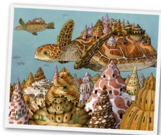
©2006 David Wiesner from Flotsam . Used with permission.

We are committed to providing a learning atmosphere that reasonably accommodates persons with disabilities who are otherwise qualified. At least two weeks prior to the start of the program, applicants with disabilities are invited to discuss the program content and available facilities with the program director.