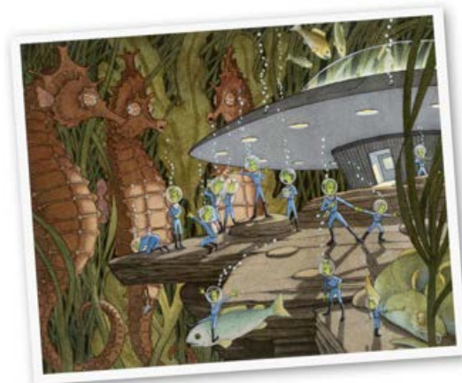
© 2006 David Wiesner from Flotsam . Used with permission.

You are also invited to spend Thursday evening in the BYU Bookstore where you will be given a 20 percent discount coupon valid for all items in the store, excluding textbooks and education computer products.