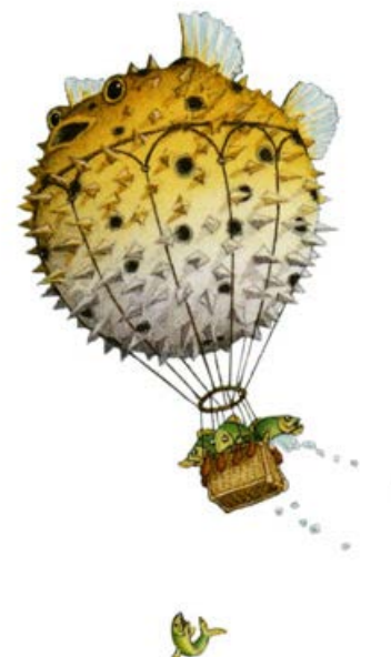
©2006 David Wiesner from Flotsam . Used with permission.

In Person: 169 Harman Continuing Education Building 770 East University Parkway Provo, Utah.